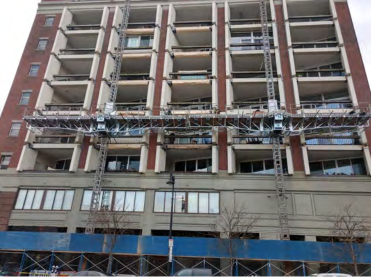
FRSM-20K THE ULTIMATE WORK PLATFORMS